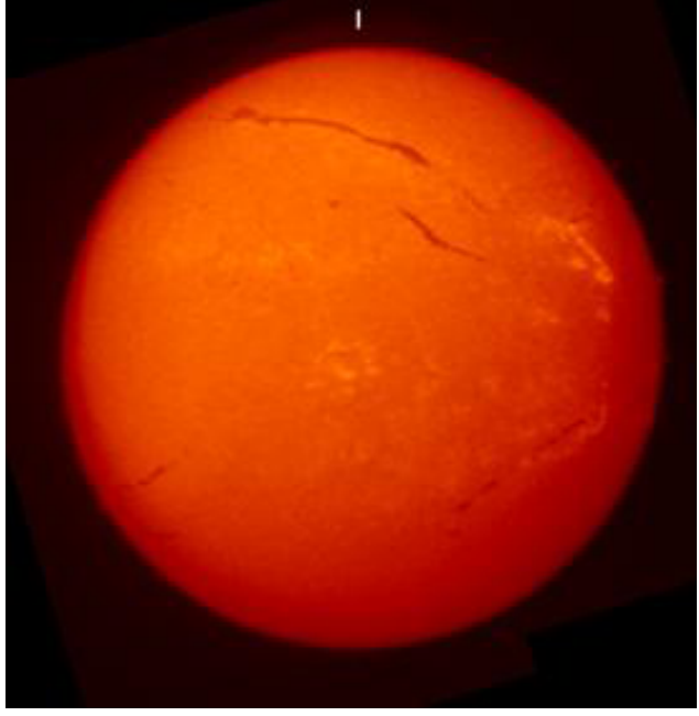
Fig. 3. In white light (left) sunspots are being followed throughout the course and simultaneously (right) we follow solar activity such as prominences in H-alpha light (Silkeborg Højskole, 2004).

The main reason that the long and uninterrupted discussions can take place is the fact that all students stay at the school during the entire course. Several of the researchers and teachers are also present during the whole course.