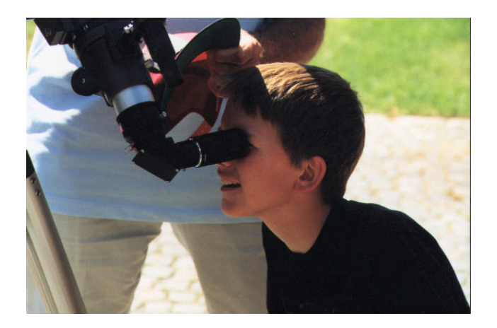
Fig. 2. For the course we have installed telescopes that can be used to perform white light visual observing as well as H-alpha observing. (Silkeborg Højskole, 2002).

the Rovers and research done at the Mars Lab at Aarhus University (see the Mars Lab homepage for more details on this research facility).